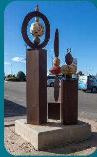
9 • "CHANGE" by Charlotte Zink, Berthoud, CO Steel and Quarry Clay 98" x 36" x 36" $11,000 Location: M Mart, 2000 South Havana St.

Change is a satisfying combination of rich textures and simple forms that creates a trio of totems rising up from steel plinths. Change is a combination of hot and cold rolled steel components playing off of clay orbs.