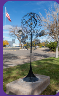
12 • "HELIX HARMONY" by Sean Yarbrough, Fraser, CO Second Place Award Winner Steel, Stainless Steel, Paint 96" x 40" x 40" $12,000 Location: Havana Exchange, 2802 South Havana St.

Kinetic DNA geometry sculpture made from stainless steel, steel, paint and bearings. The larger lower helix spins the opposite direction of the helix chain in the sphere creating beautiful motion. The center sphere and semi-spheres around it reflect the sculpture and the viewer in a brilliant way!