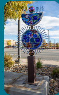
4 • "DARK SIDE OF THE HARLEQUIN MOON" by Annette Coleman, Lakewood, CO

My sculpture "Bloom" is rooted in the intricate folk art of paper cutting from Poland, my place of birth. With Bloom, I wanted to share the wonder that these forms inspire in me, hoping that the sculpture can do the same for others. The bright colors and fun, bulbous shapes are made to be eye catching, grabbing the viewer and pulling them in for a moment, adding something unique to their day out on the town.