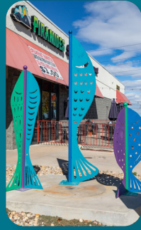
8 • "ICHTHYOLOGY" by Charlotte Zink, Berthoud, CO Steel and Enamel 96" x 36" x 36" $11,000 Location: Piramides, 1911 South Havana St.

Mermaids, water lovers, and poets are welcome to take a pause here, with these whimsical fishes, and daydream for a while. I look forward to bringing this unique whimsical energy to your beautiful town, adding just the right forms & color to compliment & celebrate the existing architecture and landscape.